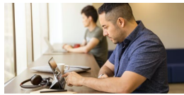
Cambridge English (FCE, CAE, CPE)